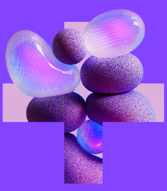
Building a world that works better for everyone